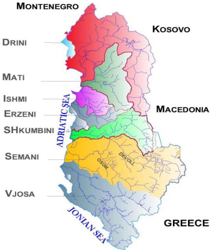
Fig. 1 Hydrographic Basins in Albania.